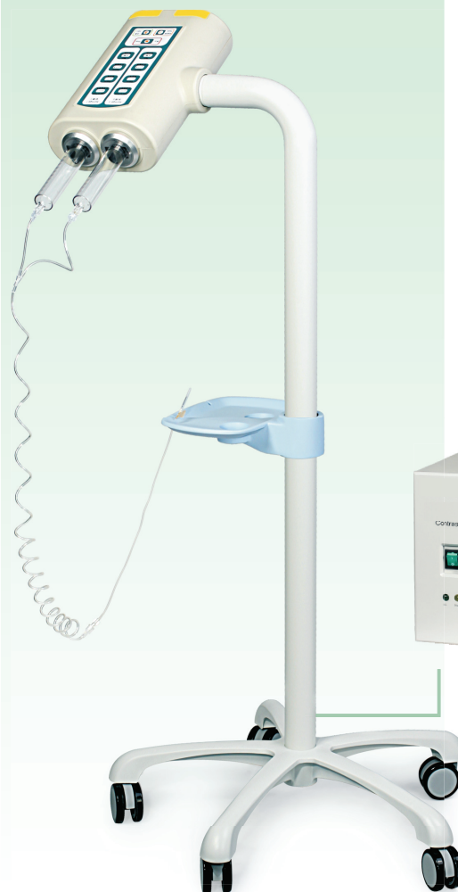
Pedestal & Injector arm

The injector is specially designed to delivery contrast medium or saline being compatible with magnetic resonance imaging system. It is approved to be used up to 3.0T MR imaging system.